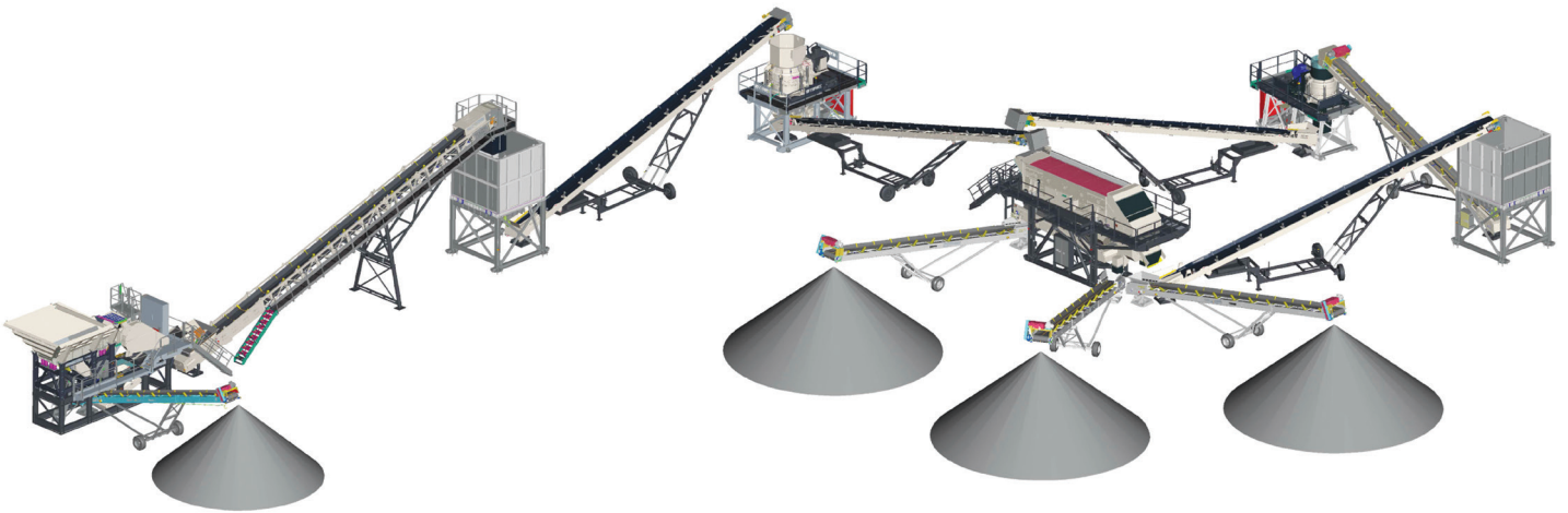
System 300 3-Stage Modular Plant (Jaw-Cone-Horizontal Screen-Cone)