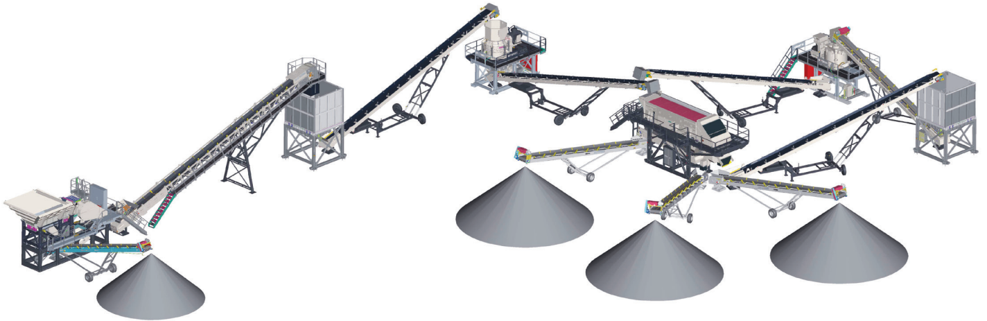
System 300 3-Stage Modular Plant (Jaw-Cone-Horizontal Screen-VSI)

The new Terex MPS System 300 allows you to pick and choose the individual modules you need to fit your application and create a plant that can process up to 300 tph (275 mtph).