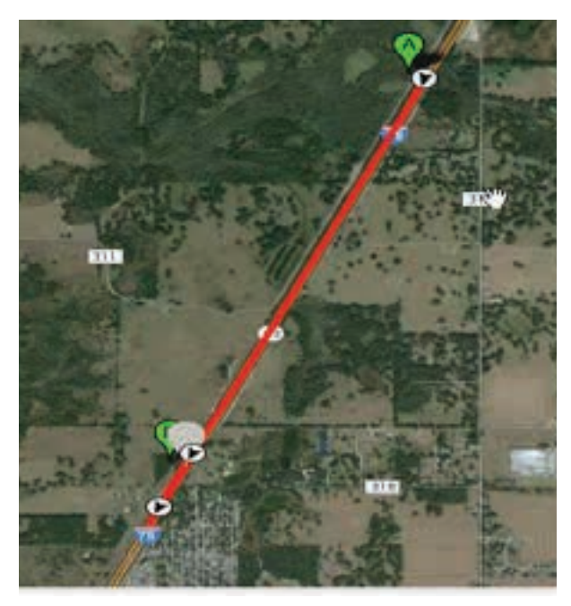
The red line on the map shows how much of the interstate project was trimmed during a given time period.