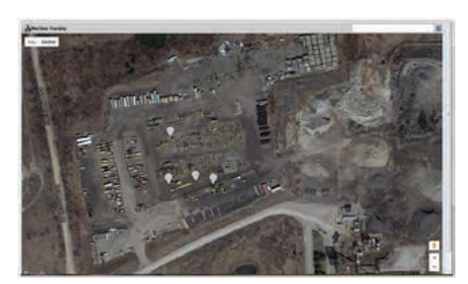
The white dots on the above map show the exact location of the GOMACO machines by mapping them through GPS positioning. This screenshot example shows all of the company's GOMACO machines are located within the company's storage lot.

GOMACO Remote Diagnostics (GRD) gives you the ability to track the movements of your GOMACO machines over a range of dates. You can see the actual street address location of the machines and have an e-mail alert sent if the machine goes outside of a specified area.