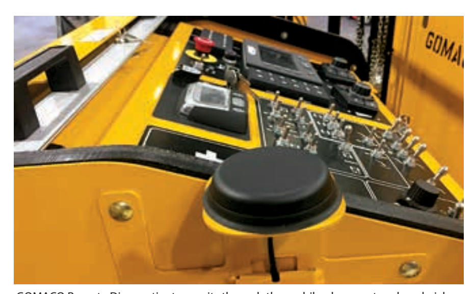
GOMACO Remote Diagnostics transmits through the mobile phone network and picks up the GPS location of the GOMACO machine.

Manufactured under one or more of the following U.S. or foreign patents: 5,924,817; 5,941,659; 6,099,204; 6,450,048; CA2,211,331; 7,044,680; 7,284,472; 7,517,171; 7,845,878; 7,850,395; CA2,864,902; CA2,591,177; 8,855,967; 8,682,622; 9,051,696; 9,180,909; 9,200,414; 9,404,228; 9,428,869; 9,458,581; 9,464,716; and patents pending.