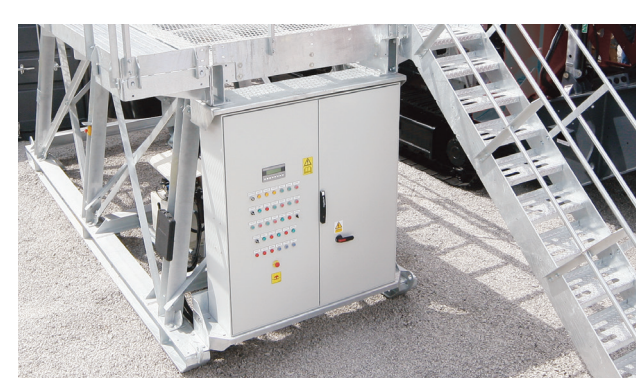
Complete Cone Starter Panel