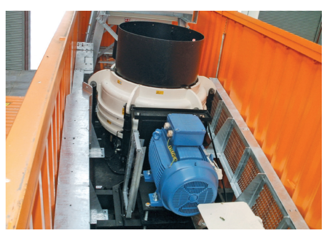
Cone Module Easily Transports in Shipping Containers